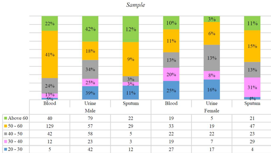
Fig. 2. Total Collected Samples – Segregated.

The highest rate of S. aureus from the processed samples was found in 50 % blood samples; where 3/9 blood – samples were males (age bracket in years: 50 – 60) and 2/9 blood-samples were females (age bracket in years: > 60) followed by 33.33 % in urine; where each 2/6 urine – samples (age bracket in years: 50 – 60) found both in males